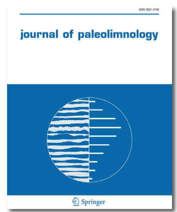
Journal of Paleolimnology